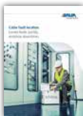
Cable fault location