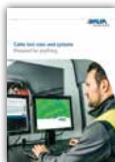
Cable test vans and systems