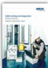
Cable testing and diagnostics