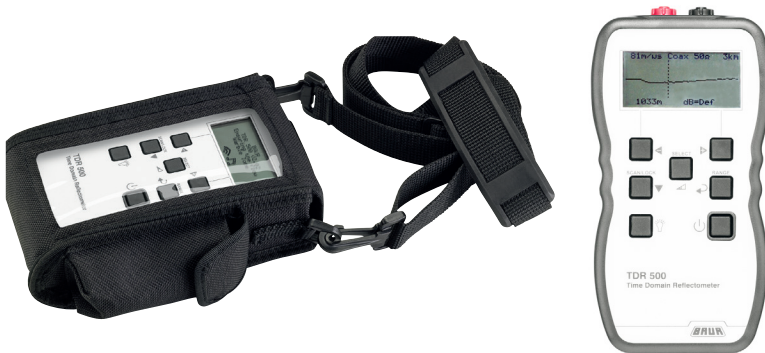
Example: TDR 500