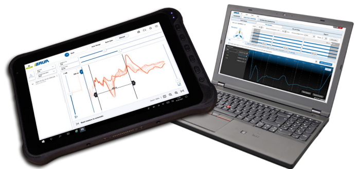
Control of the IRG 400 via tablet or laptop (The figure is illustrative)