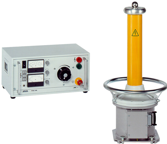
The figure is illustrative.