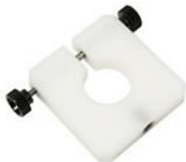
Carrier for analog rotary transducer (art.# ART-CRL-0000)