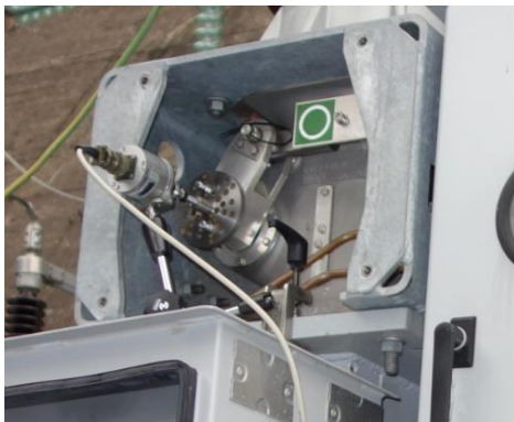
Digital rotary transducer mounted on Siemens 3AP1FI 245 kV SF6 circuit breaker