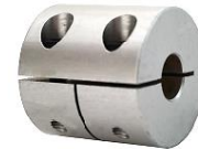
Bellow coupling M10 (art.# DRT-COUP-001)