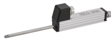
Analog linear transducer TS series

The above linear analog transducers are available in several lengths. Please contact DV Power for more information.