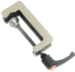
Big clamping base (Clamping range 80-85 mm) (art.# UTM-LCB-0080)