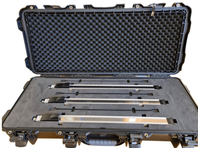
Plastic case for three linear analog transducer (TLH) 500 mm sets (PLCAS-LAT-3500)

For that purpose, DV Power offers various Plastic cases where three analog linear transducers of the same length, along with their corresponding rods could be easily positioned and preserved.