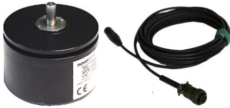
Analog rotary transducer with 5 m connection cable (art.# ART-250-C605)