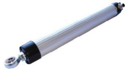
Analog linear transducer LWG series