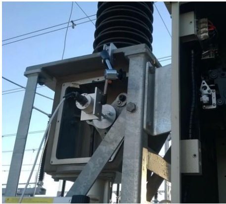
Digital rotary transducer mounted on ABB LTB 245 kV SF6 circuit breaker