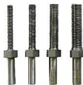
Four mechanical adapters 6 mm (M6, M8, M10, M12) (art.# DRT-MADP-604)