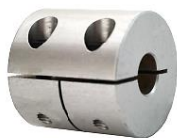
Bellow coupling (M6) (art.# DRT-COUP-003)