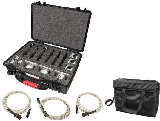
Three phase digital rotary transducer kit (with 10 m connection cable) (art.# TPH-DRTS-010)