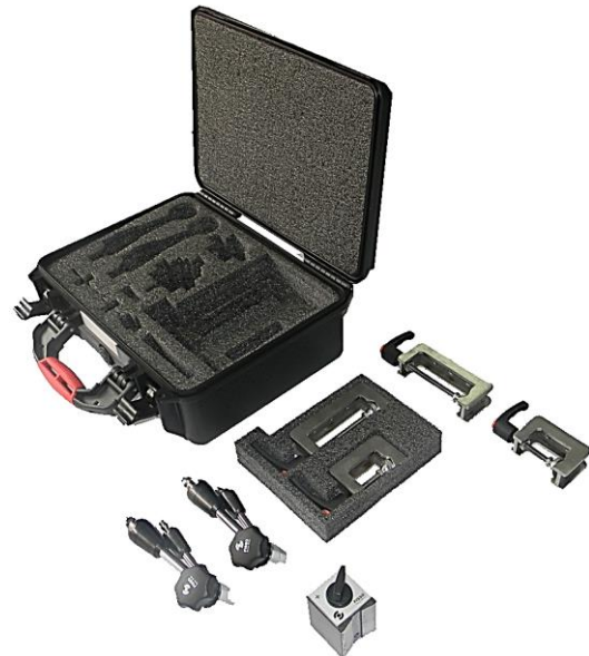
Universal transducer mounting kit – Extended version (unpacked)