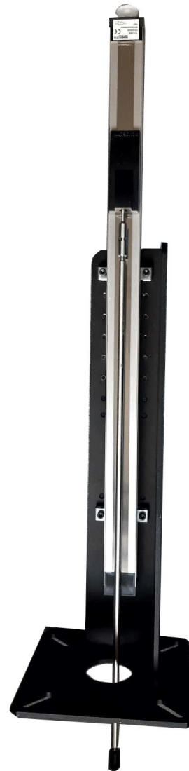
Mounting bracket for analog linear transducer (LAT-MNTB-000)