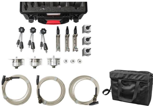
Three phase digital rotary transducer kit (with 10 m connection cable) - unpacked