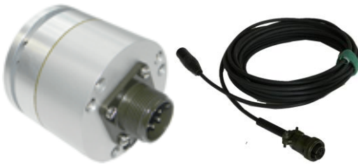
Digital rotary transducer with 5 m connection cable (art.# DRT-250-C605)