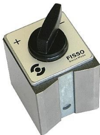
Magnetic base (M8 screw holder; Holding force: 800 N; Base size: 63 mm x 50 mm x 55 mm) (art.# UTM-MAG-0800)