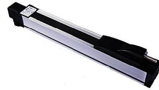
Analog linear transducer TLH series