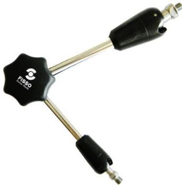
Articulated arm (M8 screw holder; Length: 288 mm) (art.# UTM-AA-0288)