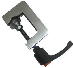
Small clamping base (Clamping range 30-35 mm) (art.# UTM-SCB-0030)