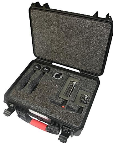
Universal transducer mounting kit – Extended version (art.# UTM-KIT-0001)