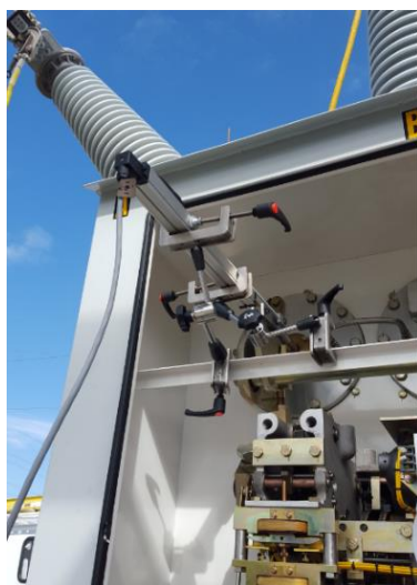
Analog linear TLH transducer mounted on Mitsubishi SF6 138 kV 120-SFMP-40HE