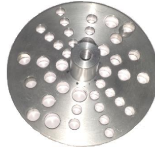
Universal adapter for rotary transducer mounting (Art.# RDTR-ADPT-00)

Universal adapter is designed to enable rotary transducer mounting to wide range of circuit breakers (e.g. Siemens, ABB, Alstom, etc.).