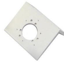
Carrier (L profile) for digital rotary transducer (art.# DRT-CRL-0090)