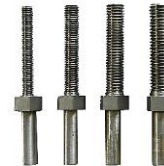
Four mechanical adapters 10 mm (M6, M8, M10, M12) (art.# DRT-MADP-004)