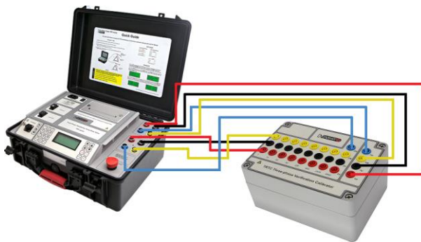
Connecting TRT with 4 connectors for H cables and 4 connectors for X cables

TRTs with 4 connectors for H cables and 4 connectors for X cables