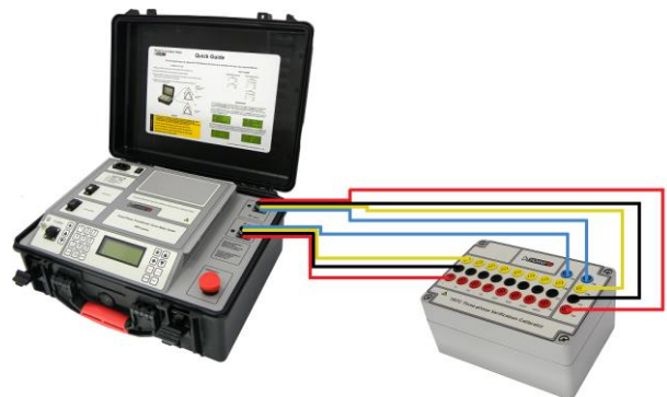
Connecting TRT with 1 connector for H cables and 1 connector for X cable

TRTs with 1 connector for H cables and 1 connector for X cables