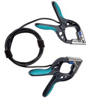
Jumper cable with small TTA clamps