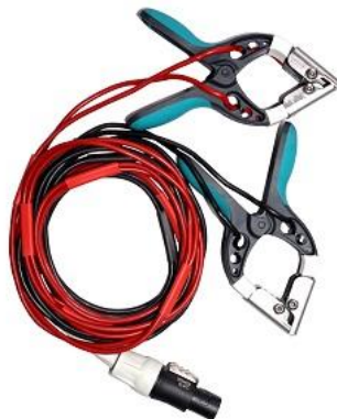
X winding current and sense cables with small TTA clamps