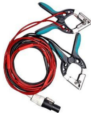
X winding current and sense cables with small TTA clamps