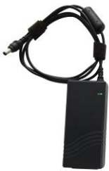
Mains power cable with power supply adapter 18 V / 3 A