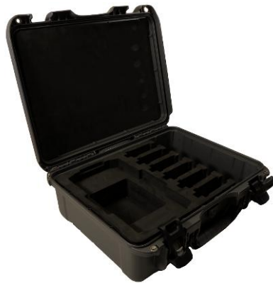
Plastic transport case for TWR-H, TRT-H & RMO-TH