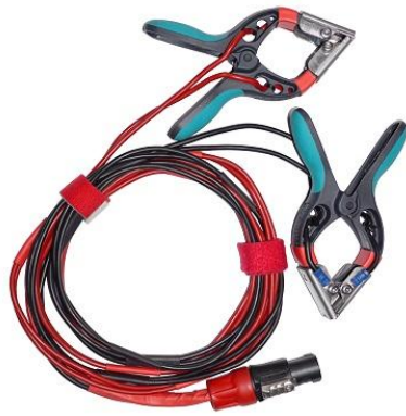
H winding current and sense cables with small TTA clamps